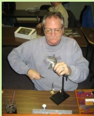
Monday night tying at the American Legion. We had a great time swapping stories.